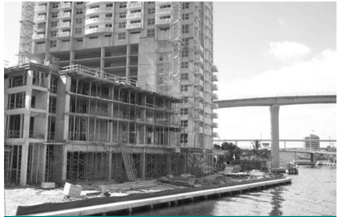
CONSTRUCTION PROCEEDS ON BRICKELL ON THE RIVER'S RIVERWALK. All new projects along the river are providing publicly accessible riverwalks.

unanimously adopted by the Miami River Commission, the Miami City Commission and the Miami-Dade County Commission in 2001. The plan is being put to work, as some greenway sections are under construction, with others about to break ground.