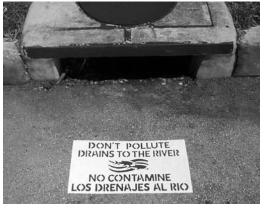
IN 2004, 75 OF THESE ADVISORY SIGNS were placed by storm drains along the Miami River as part of a public information program to discourage polluters.

Further funding has become available as residents approved on Nov. 2 additional money for stormwater improvement projects. The Miami River Commission, in partnership with Florida International University, installed environmental messages adjacent to storm drains throughout the river, warning against polluting near drains which flow into the river.