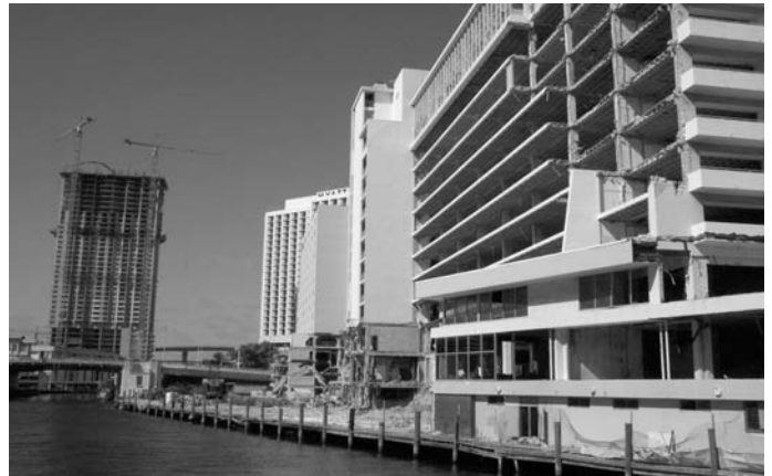
THE OLD DUPONT PLAZA WAS TORN DOWN to make way for twin residential towers and a riverwalk connecting the Miami River with Biscayne Bay. The Brickell on the River project is under construction in the background, just west of the Brickell Avenue Bridge.

Miami-Dade Water and Sewer Department, City of Miami and the South Florida Water Management District. The report (available at www.miamirivercommission.org ) contains 32 recommendations at an estimated cost of $18.4 million; $7 million of