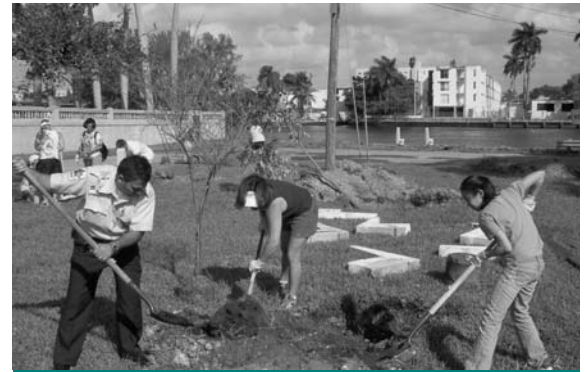
VOLUNTEERS FROM HANDS ON MIAMI and the Miami River Commission plant trees donated by Carnival Cruise Lines at a pocket park in the historic Grove Park neighborhood on NW South River Drive and NW 16th Ave.

In response to the concerns of the community, the Army Corps is prohibiting open-air drying of the sediments, which environmental